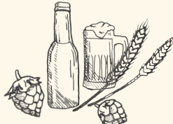
Bottle Ready Beer Straight Malt, Pilsner & Black Stout