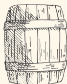
Aging French Oak 29 mths