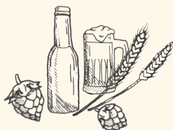
Bear Republic Beer Bottle-ready Big Bear Black Stout