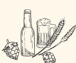
Bear Republic Beer Bottle-ready Racer 5 IPA