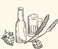
Beer Bottle-ready Pilsner